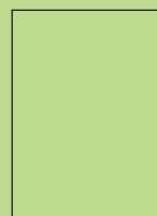
FULL PAGE 7½ H x 4½ W